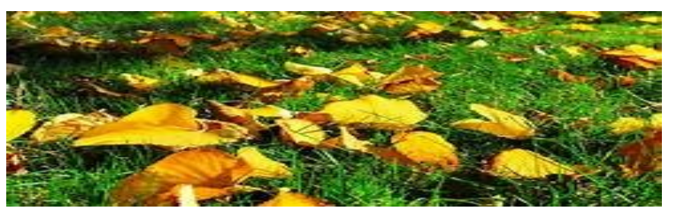
Page 13 of 37