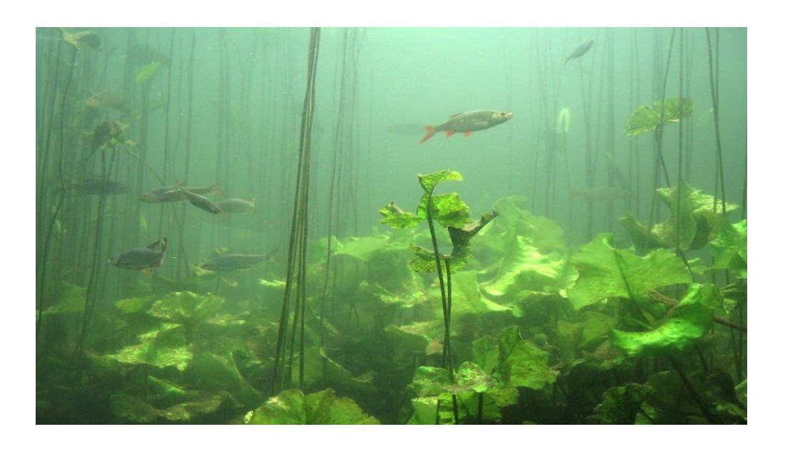
Page 9 of 37