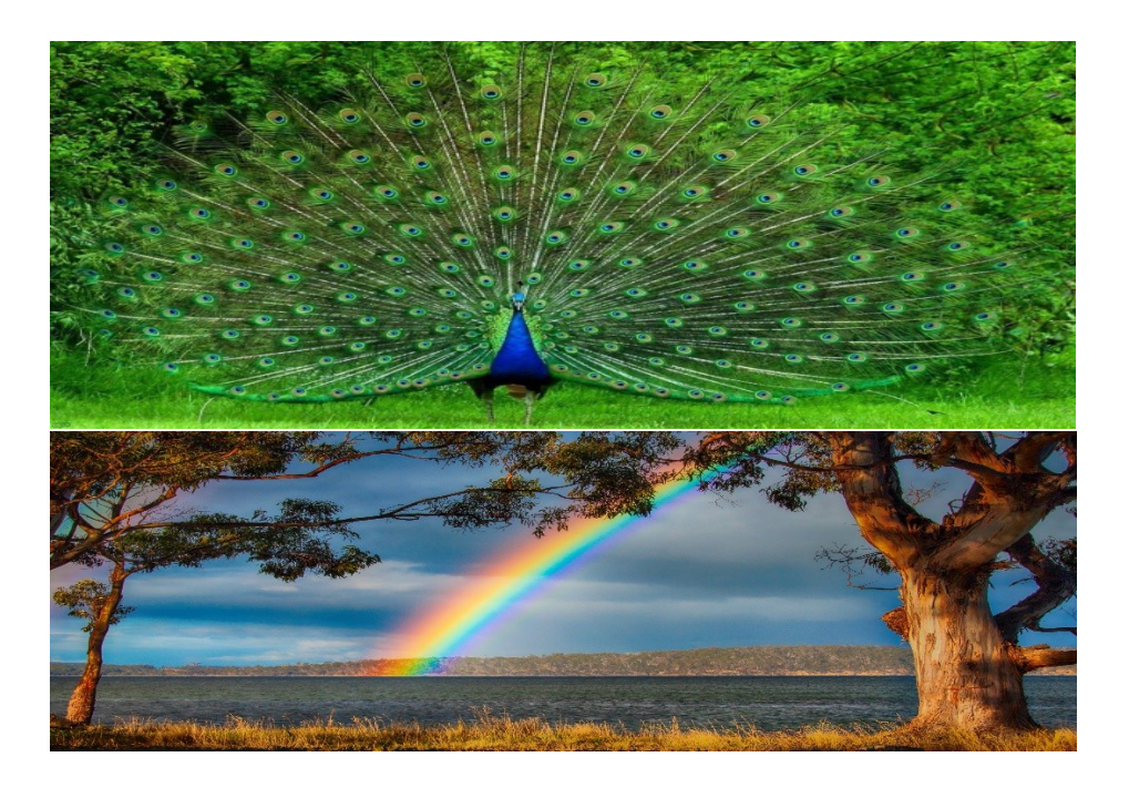
Page 12 of 37