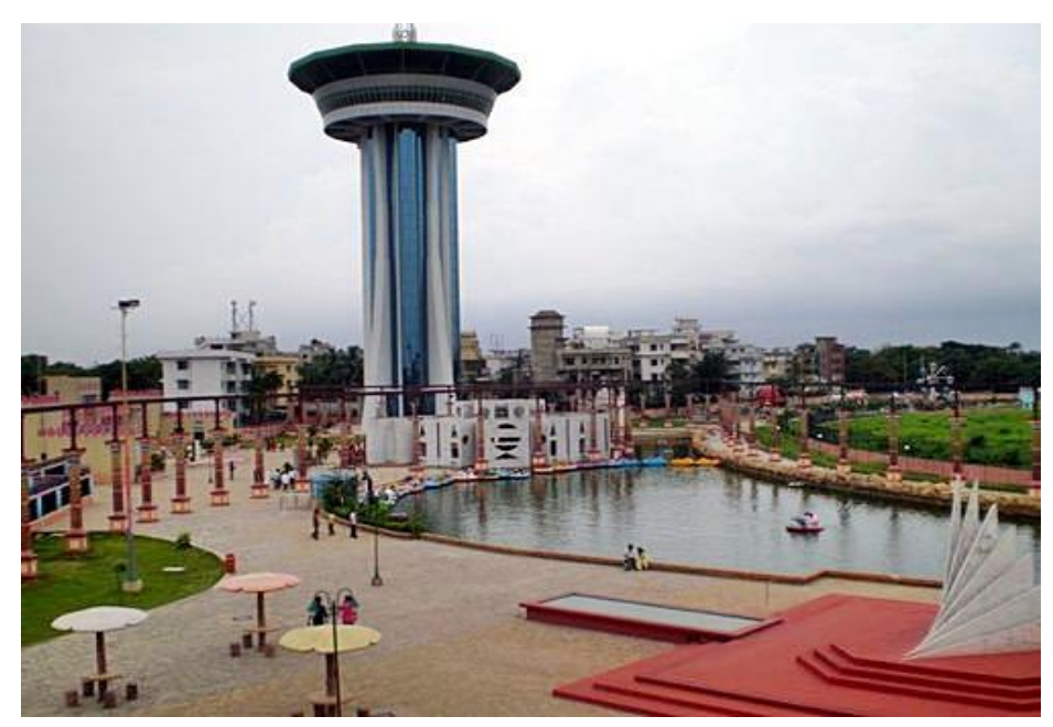
10. HOT AIR BALLOON RIDES